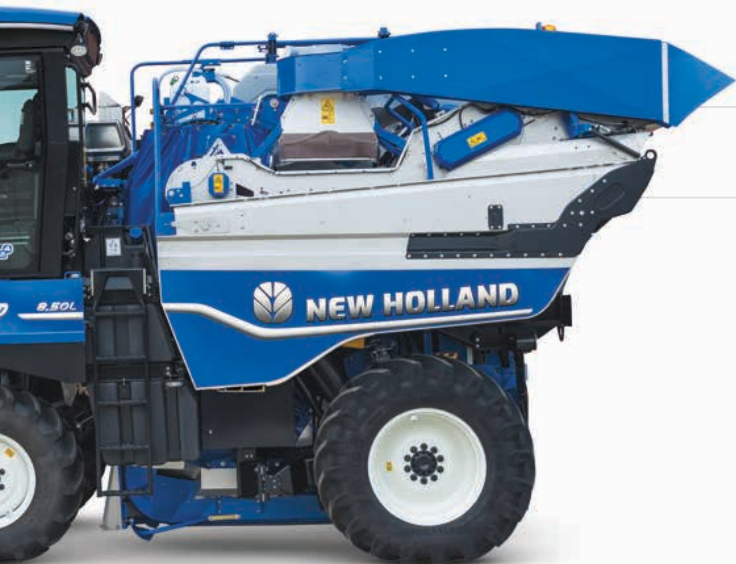
Powered with precision See page 14